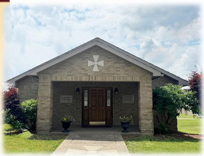
St. Margaret of Castello Adoration Chapel 43 Mahlon St. Shinnston WV

Since Covid, our Adoration Chapel had to make major changes in its 24/7 operation. As of now, we are only able to have it open for 3 out of 7 days (from 6:00am – 12:00am). We are sincerely hoping to open it another day during the week. With that said, we began last spring asking for people to consider becoming an adorer on Tuesdays. We were able to fill many hours, but not all. The hours that still need an adorer for Tuesdays are 6:00am, 8:00am, 9:00am, 10:00am, 12:00pm, 3:00pm, 6:00pm, and 10:00pm. If you are interested and able to take any of these hours, please contact the church office. Please consider spending one hour a week in adoration with our Lord, the chapel is such a peaceful and beautiful place!