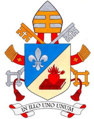
Pope Leo XIV's coat of arms

The lower half of the shield has a light background and displays an image that recalls the Order of Saint Augustine: a closed book with a heart pierced by an arrow. This is a direct reference to the conversion experience of Saint Augustine himself, who described his personal encounter with God's Word using the phrase: " Vulnerasti cor meum verbo tuo " - " You have pierced my heart with your Word. "