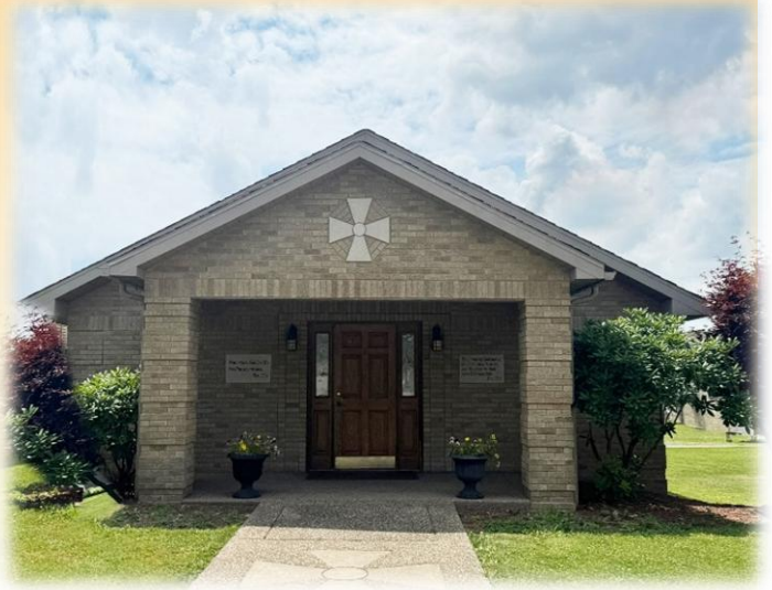
St. Margaret of Castello Adoration Chapel 43 Mahlon St. Shinnston WV

Since Covid, our Adoration Chapel had to make major changes in its 24/7 operation. As of now, we are only able to have it open for 3 out of 7 days (from 6:00am – 12:00am). We are sincerely hoping to open it another day during the week. With that said, we began last spring asking for people to consider becoming an adorer on Tuesdays. We were able to fill many hours, but not all. The hours that still need an adorer for Tuesdays are 6:00am, 8:00am, 9:00am, 10:00am, 12:00pm, 3:00pm, 10:00pm. If you are interested and able to take any of these hours, please contact the church office. Please consider spending one hour a week in adoration with our Lord, the chapel is such a peaceful and beautiful place!